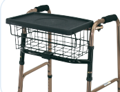
OPTIONAL Basket and Tray Ordering Code: 1860

The Deluxe Folding Walking Frames are supplied in boxes and come folded, for easy transportation. The contents include one complete Deluxe Folding Walking Frame and one user manual.